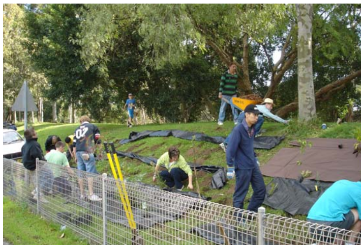
The Working Bee in full swing