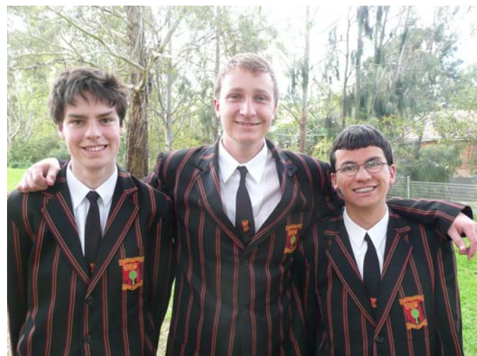
Our Captains and Senior Prefect for 2009