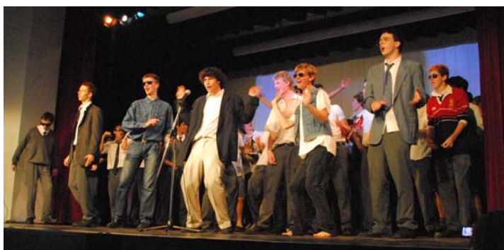
Year 12 Farewell Concert