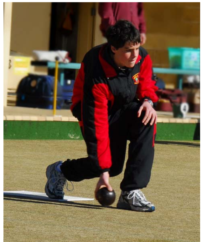
Senior Lawn Bowls Final – deep in concentration