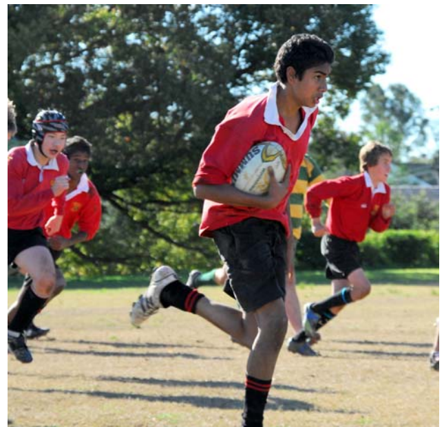
Rugby 15Bs in action in the Final

This week saw the culmination of the grade sports competitions and Normanhurst had 7 teams who reached the finals. Unfortunately, some of the games had to be called off because the council closed the fields. On Friday, I was able to present champions trophies to our Open Football Team (joint winners with Homebush), 15B Rugby (joint winners with Epping), our 15s Tennis and our 14s Table Tennis. Congratulations to all the boys in these teams, to their coaches and to all the teams who reached the finals.