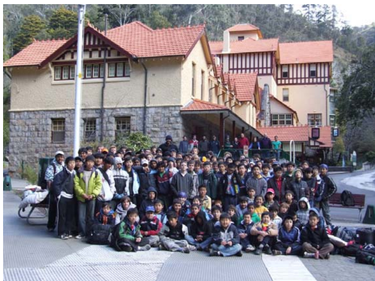
Celebrating 50 years of Normanhurst visiting Jenolan Caves